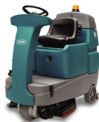
TENNANT Industrial Cleaning Equipment