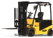
Electric Forklifts 1 to 5 tonne