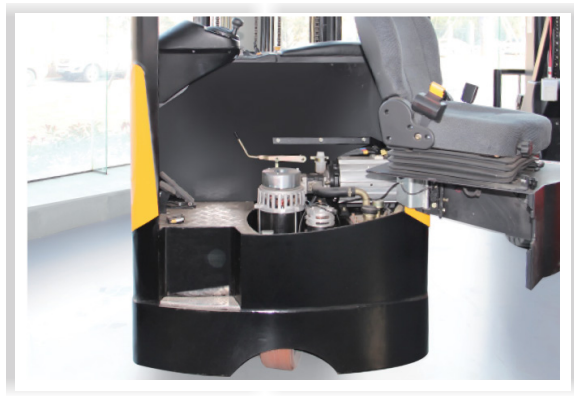
EASE OF SERVICE ACCESSIBILITY