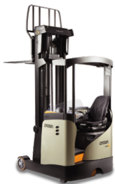
CROWN Warehousing Equipment