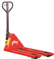
Hand Pallet Truck 2.5 tonne