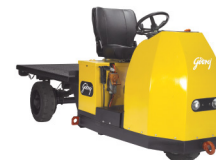
Platform Truck 2, 3, and 4 tonne