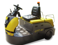
Tow Truck 2, 5 and 6 tonne (Stand up & sit down model)