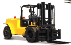
Diesel Forklifts 5 to 10 tonne