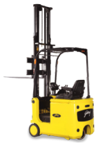
3-wheel Electric Forklifts 0.8 to 1.6 tonne