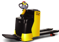
Powered Pallet Truck 1.5 and 2 tonne