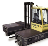
HUBTEX Side Loaders