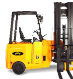
Articulated Forklifts 1.2 to 2 tonne