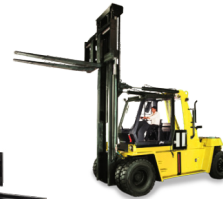
Diesel Forklifts 12 to 25 tonne