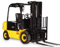
Diesel Forklifts 1.5 to 4 tonne