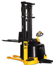
Electric Stacker 1.2 and 1.5 tonne