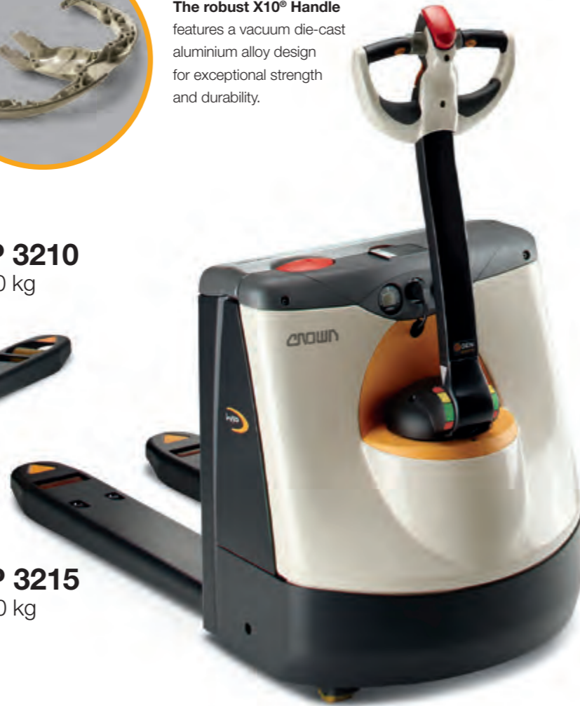
WP 3215 1600 kg