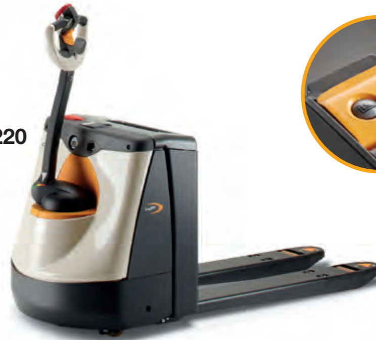
WP 3220 2000 kg