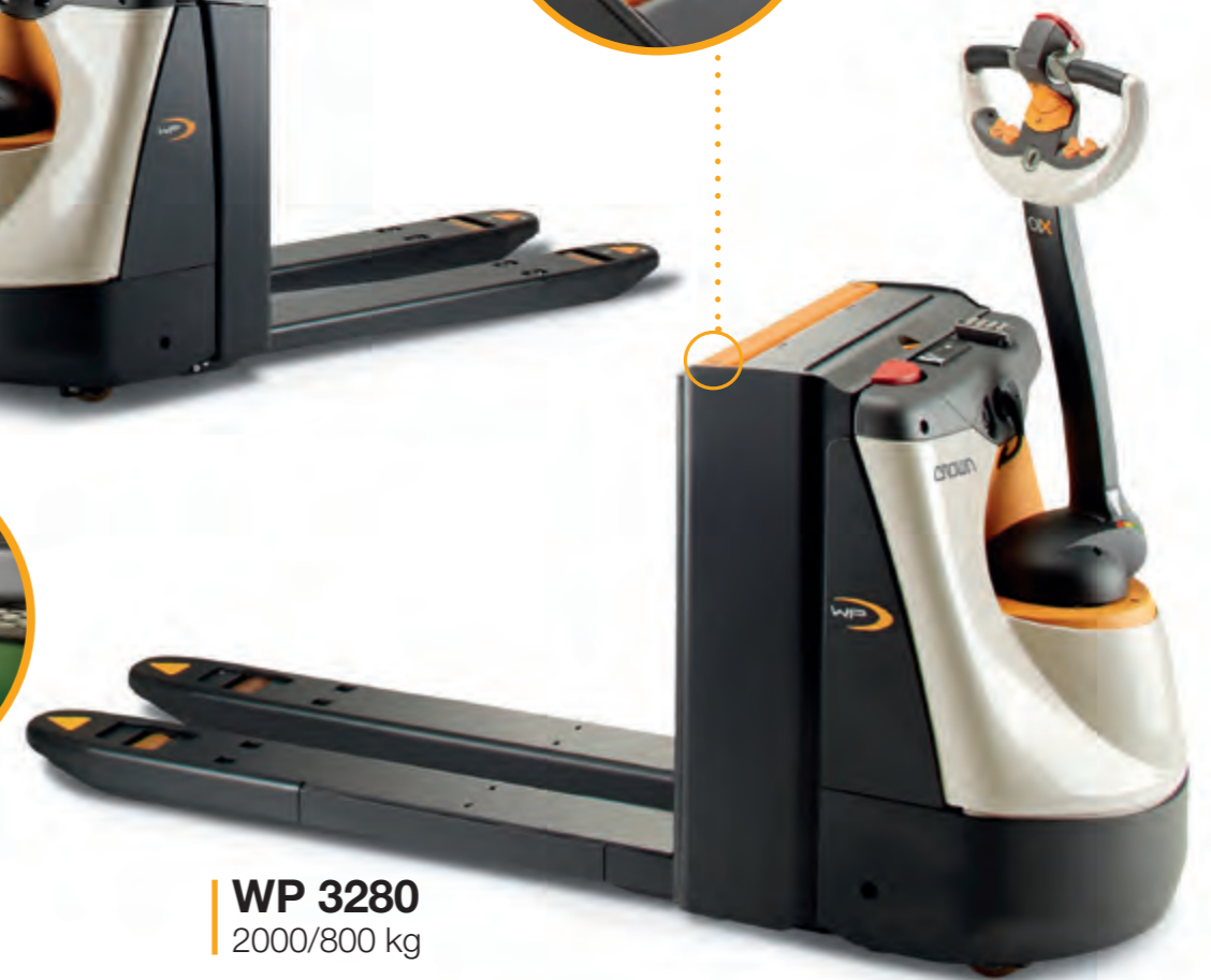
WP 3280 2000/800 kg

The pull-rod lift linkage (certain models only) places the riser axle at the highest point possible to eliminate damage and wear in uneven floor applications.