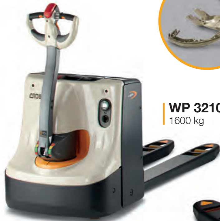
WP 3210 1600 kg

The robust X10® Handle features a vacuum die-cast aluminium alloy design for exceptional strength and durability.