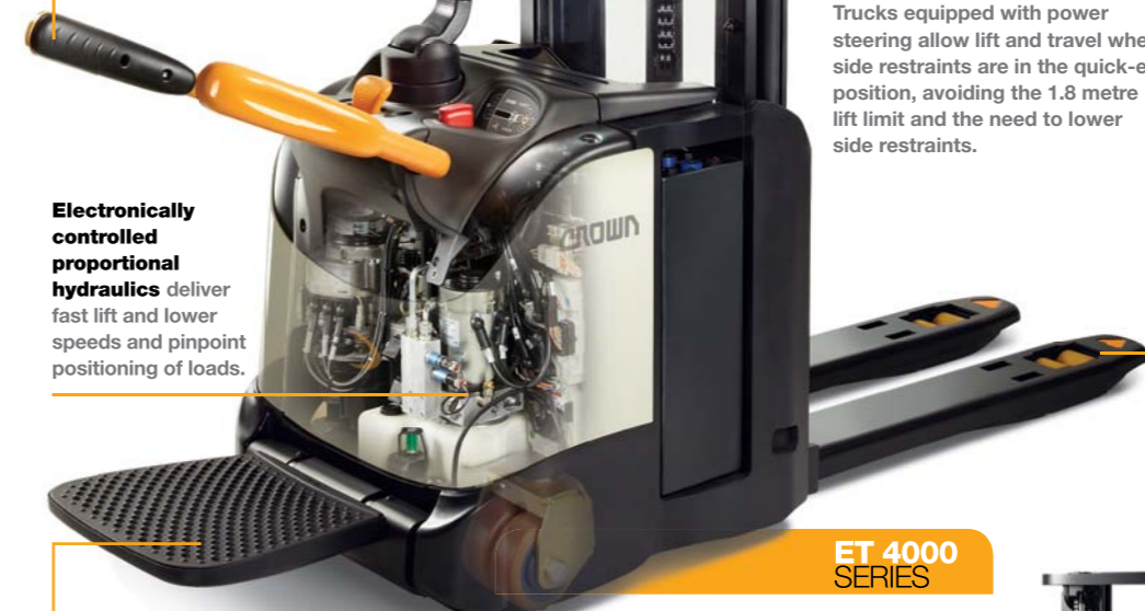
ET 4000 SERIES

Electronically controlled proportional hydraulics deliver fast lift and lower speeds and pinpoint positioning of loads.